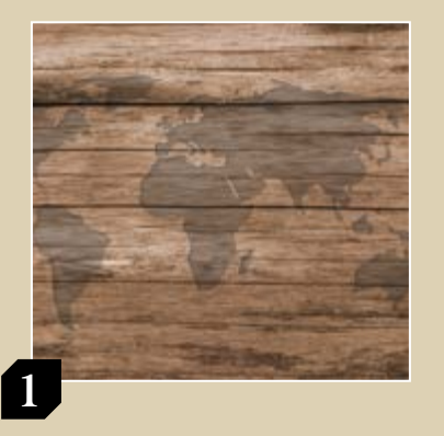
Deciding where to go.

Here are 3 easy steps to finding that perfect holiday.