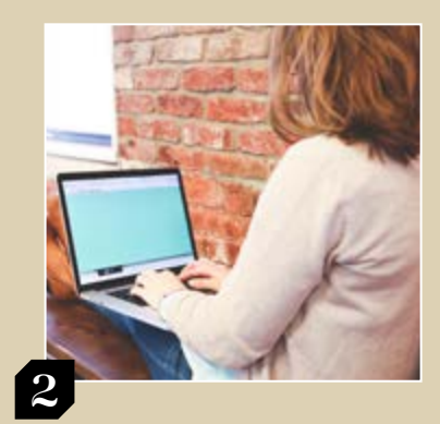
Booking a hotel or tour using an online booking platform, organised by an agent that list a range of sustainable holidays, tour companies, and places to stay