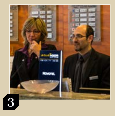
Booking directly with a hotel that promotes its sustainable credentials.

Travel is a social contract, a mutually beneficial relationship based on respect.