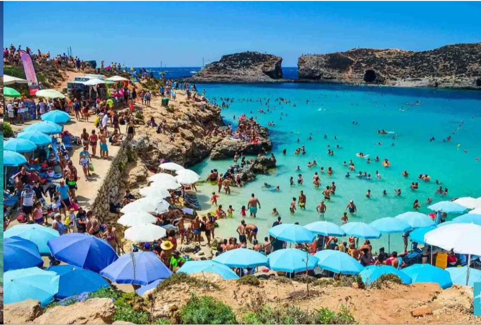
What they get ...