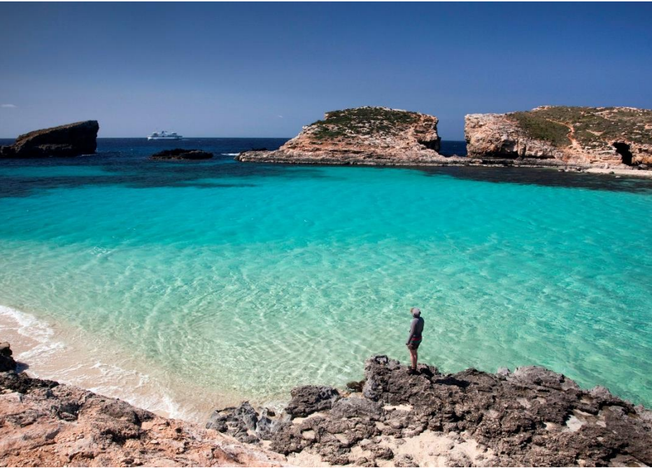
What we show them ...